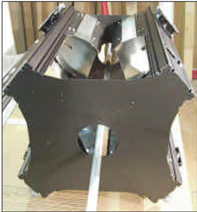
The Cure Tunnel's™ price and performance make it a standout among its competition!