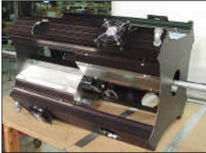
The Cure Tunnel™ focuses uniform 400W/in light around galvanized steel pipe, easily curing at speeds exceeding 350ft/min.

3-D UV Curing Just Saw the Light at the End of the Tunnel