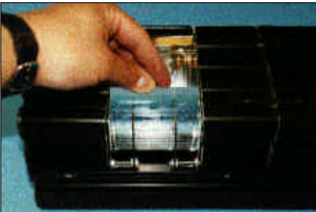
Reflector material can be easily replaced for maintaining optimum efficiency.

UV Process Supply proudly offers the CON-TROL-CURE Portable 2 UV Curing System : a detached 2" curing lamp connected to the power supply by an extended power cable.