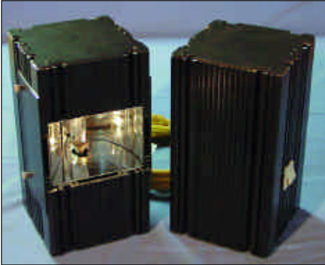
Portable 2 UV Curing System with detached power supply (inset: Portable 2 Curing System, fully encased)

Hand-held, powerful UV curing system with 2" wide reflector ideal for laboratories, on-site demos, prototype and repair applications