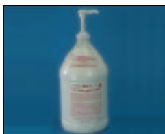
UV Hand Cleaner