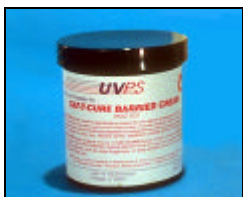
UV Barrier Cream

PRINTORK DISPENSER [Wall Mount (#J006-003), Floor (#J006-004)] Sturdy wall or floor model frames provide stability for reliable dispensing of Printork Disposable Wiper rolls.