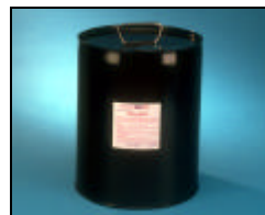
Clean-Up Solvent #314