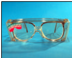
UV Filter Safety Glasses