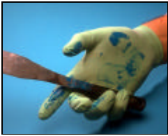
Latex Surgical-Type Gloves