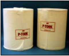
PrintTork Disposable Wipers

Features our most popular UV safety and handling products for working with UV-curable inks, coatings and adhesives