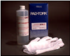
Lamp/Reflector Maintenance Kit

These sleeves are flexible plastic filters designed to fit over standard fluorescent light tubes. No tools are required for their installation. Includes a UV inhibitor that will never wear out and never need replacement. Four sleeves included.