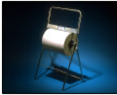
Printork Dispenser (Floor Model)