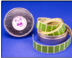
UV Intensity Labels