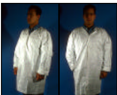
Disposable Lab Coats