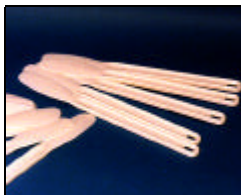
White Plastic Spatulas