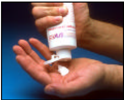
UV Skin Lotion